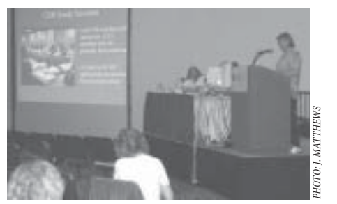
Staff from NIH Center for Scientifice Review (CSR) conduct a workshop during the ARVO 2003 Annual Meeting to explain the CSR's Role in the grant application review process.

Staff from the NIH's Center for Scientific Review (CSR) conducted the workshop to help ARVO members understand what happens to their grant application after it is mailed.